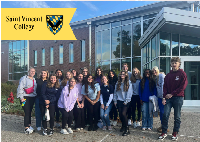
Saint Vincent College