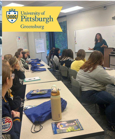
University of Pittsburgh Greensburg